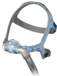
Complete Pixi system 61030