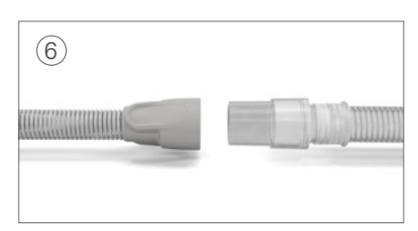
Connect the free end of the air tubing firmly onto the assembled mask. Press Start/Stop to begin therapy.