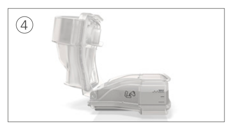
Open the water tub and fill with water up to the maximum water level mark.