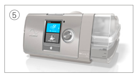
Close the water tub and insert it into the side of the device