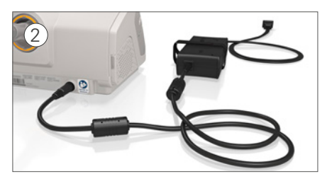
Plug the power connector into the rear of the device. Connect one end of the power cord into the power supply unit and the other end into the power outlet.