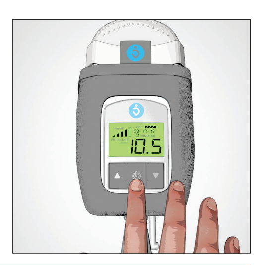
IMPORTANT: The "REMINDER" indicator will display on the Z1 if an air leak is detected between the Z1 outlet and the mask. This may also display at times when the mask is not being worn properly. This common condition should clear once all connections are secure, the mask is properly worn, and therapy has begun.

NOTE: It is recommended that you fully charge the battery prior to each use. Instructions on how to charge the battery are available on the back of this Getting Started Guide.